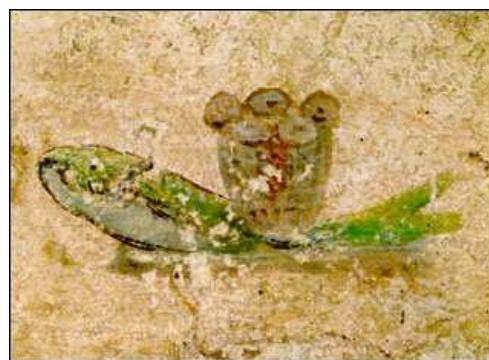
Image captured from < http://www.jesuswalk.com/christian-symbols/images/fish_bread.jpg >