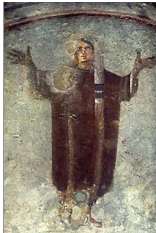
Image captured from < www.kaleo.ws/kaleo/knowning_jesus_personally >

of the god Hermes who guided the deceased to the underworld and the afterlife.[8] With the exception of the specific reference to the god Hermes the image conjured the same basic feelings –sentiments of caring and guiding-- when used in a Christian environment. The Christian image of the Good Shepherd , on a primary level, communicates the same sentiments.